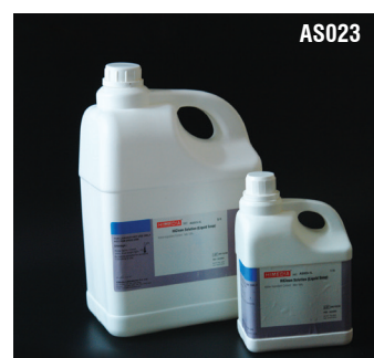
Hiclean (liquid soap)